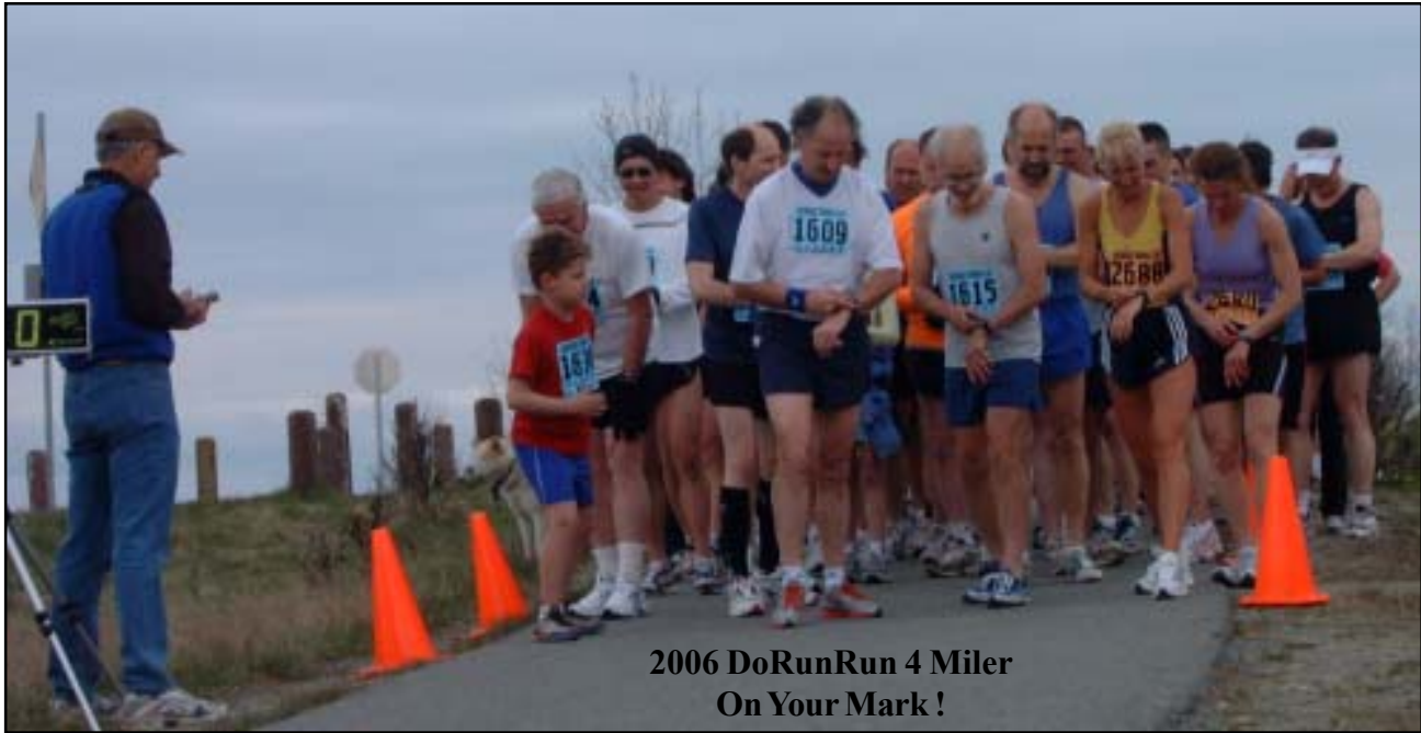
2006 DoRunRun 4 Miler On Your Mark !